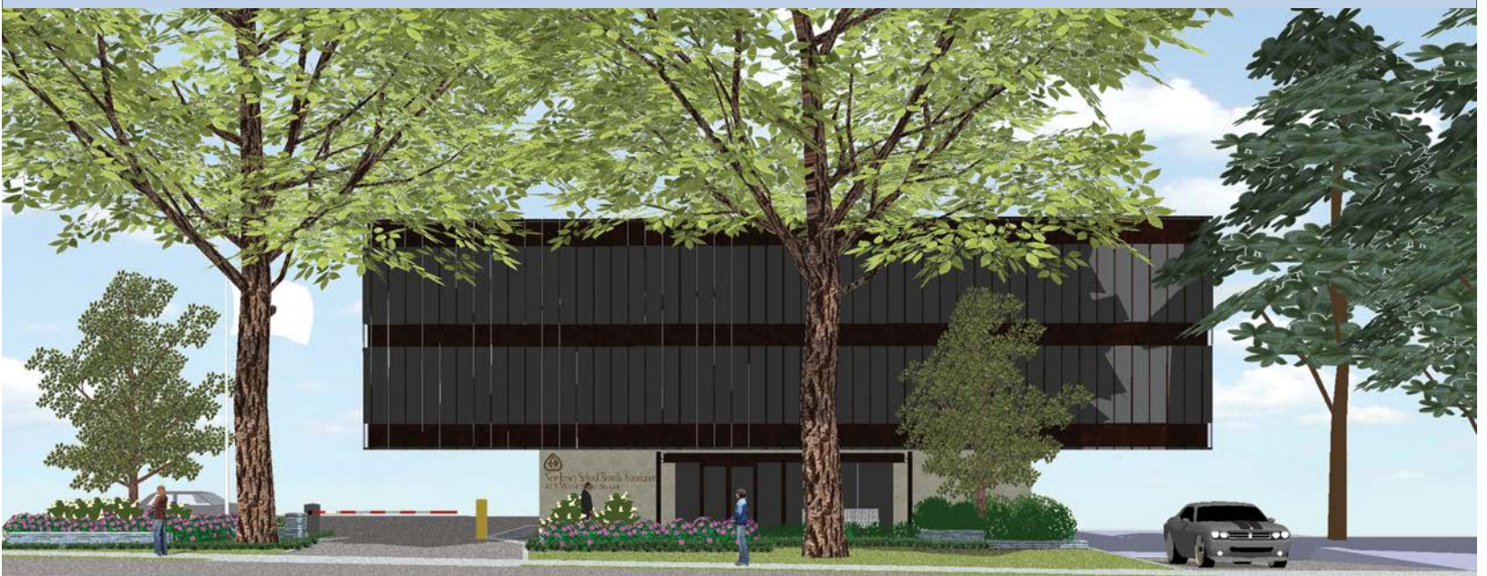
Proposed NJSBA Headquarters Renovation in Trenton

The New Jersey School Boards Association (NJSBA) selected Cambridge to manage the design and construction of your association's headquarters renovation at 413 West State Street. Working on important projects like this building, we've built a strong reputation for service and successful project delivery.